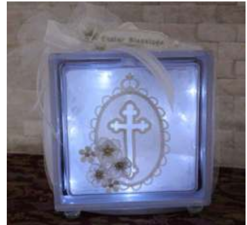
Lighted glass tile projects. Vol1. Easter, Christmas and Wedding blessings.

LMO1048: Free Easter window motif. Lovely design for Easter cards. Hoop with tearaway stabilizer and your project fabric.